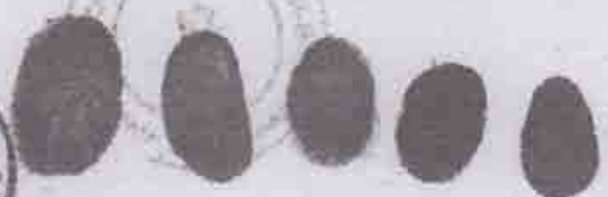
Exhibit is admitted